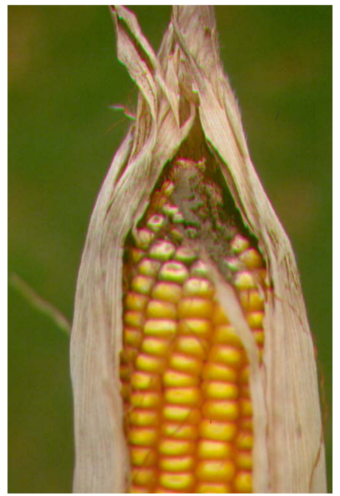
August 2007 Agronomy Notes

Figure 4. Aflatoxin is a by-product of Aspergillus fungal growth. However, the presence of fungal growth does <u>not</u> necessarily mean aflatoxin is present.