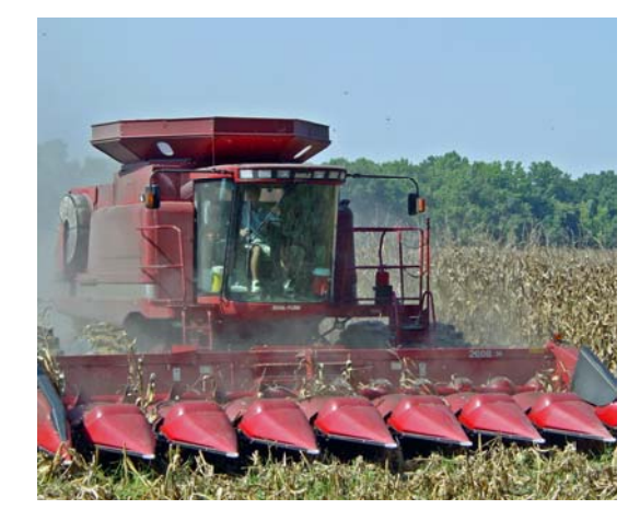
Figure 1. Combine harvesting corn.

Grain moisture dockage - Corn may be harvested any time after grain reaches physiological maturity, which occurs at around 30% moisture. However, corn may not be safely stored until considerable moisture loss occurs. Thus, grain elevators discount wet corn to account for drying expenses and moisture weight loss during drying. Moisture dockage schedules between elevators may vary significantly, so thoroughly compare rates. Most schedules discount about 2.5% per each percent moisture above the standard, and may increase as moisture content rises. Water evaporated during drying (shrinkage) accounts for 1.18% of the dockage per each percent moisture. The producer loses this weight regardless of whether they sell wet grain to the elevator, dry it mechanically or let the grain field dry. Thus, a producer should subtract this value from the dockage rate to show their realized or "actual" dockage.