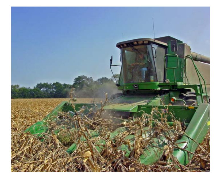
Figure 3. Harvesting severely lodged corn is a long, tedious process with significant harvest loss and inefficiency.

Aflatoxin tips - Aflatoxin contamination is a sporadic problem that Southern corn producers customarily prepare for. Perhaps the best method to minimize aflatoxin problems is to encourage strong plant health during the growing season by using sound agronomic practices, because extreme environmental stress normally promotes aflatoxin development. Fortunately, early harvest reports have indicated no apparent problems thus far this season. However, if aflatoxin is present during harvest, growers can also lessen aflatoxin contamination by properly storing and drying grain, maintaining grain quality, and sanitizing grain-handling equipment. Separately harvest obviously stressed, stunted or damaged areas and field edges, if you suspect any aflatoxin problem. These areas are much more likely to contain high levels of aflatoxin. Fungal infection is more likely in shriveled, cracked kernels and foreign material. Thus, grain quality may be significantly im-