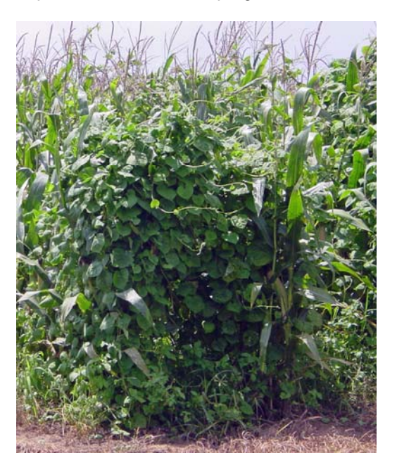
Figure 2. Morninglory growth can definitely impede combine harvest progress.

Harvest timing and expected losses -Harvest losses are just as important as moisture dockage rate in evaluating your harvest timing decision. The longer corn stays in the field, the greater the likelihood of substantial field losses. Factors such as stormy weather and southwestern corn borer damage can cause considerable lodging in unharvested fields. Late summer rainfall can also promote morningglory growth, which can greatly inhibit harvest efficiency. Each of these factors may cause substantial field loss, which would considerably outweigh moisture savings. Producers should also consider their harvest capability -- the longer it takes to complete harvest, the earlier you should start harvest. Besides harvesting drought-stricken fields promptly, growers should also harvest non-Bt hybrids infested with corn borers, early maturing hybrids or fields, and those possessing below average stalk quality as quickly as possible. Producers should closely check for loss while the combine is harvesting and make adjustments accordingly. Two corn kernels per square foot or one dropped ear per 100 feet of row equals about 1 bushel per acre yield loss. Research generally indicates combine efficiency is best when corn grain moisture is about 20-22%. Thus, growers seeking maximum profitability should always strive to finish harvest before grain moisture falls below 15%.